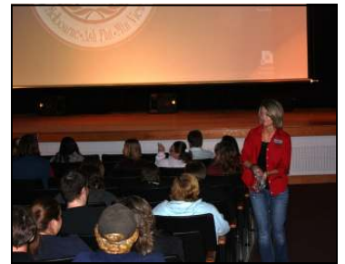
Photos from the Student Conference.