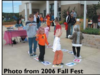
Photo from 2006 Fall Fest