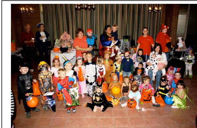
Young students from the Ozarka Kids Academy trick-or-treated at the College on Friday. Several individuals and departments set up and decorated tables in the dining room of the Administration building. Fun was had by all who participated!

FOR THE MOST CURRENT EVENTS AROUND CAMPUS CHECK THE ONLINE CAMPUS CALENDAR AT WWW.OZARKA.EDU UNDER NEWS & EVENTS