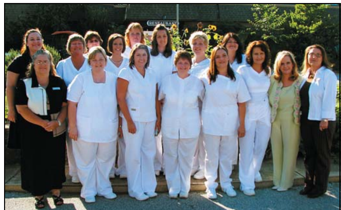
Mtn. View LPN Class of 2008