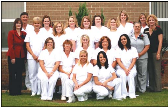
Ash Flat LPN Class of 2008

The first class of Practical Nursing students in the Ozarka College Ash Flat and Mountain View 11-month programs were honored at Recognition Ceremonies on August 7 and 8, 2008.